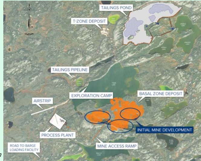
Nechalacho Site Plan

REE processing does not include separation. Avalon has retained SNC Lavalin to complete a scoping study on establishing a separation plant in North America to consider options for production of separated oxides.